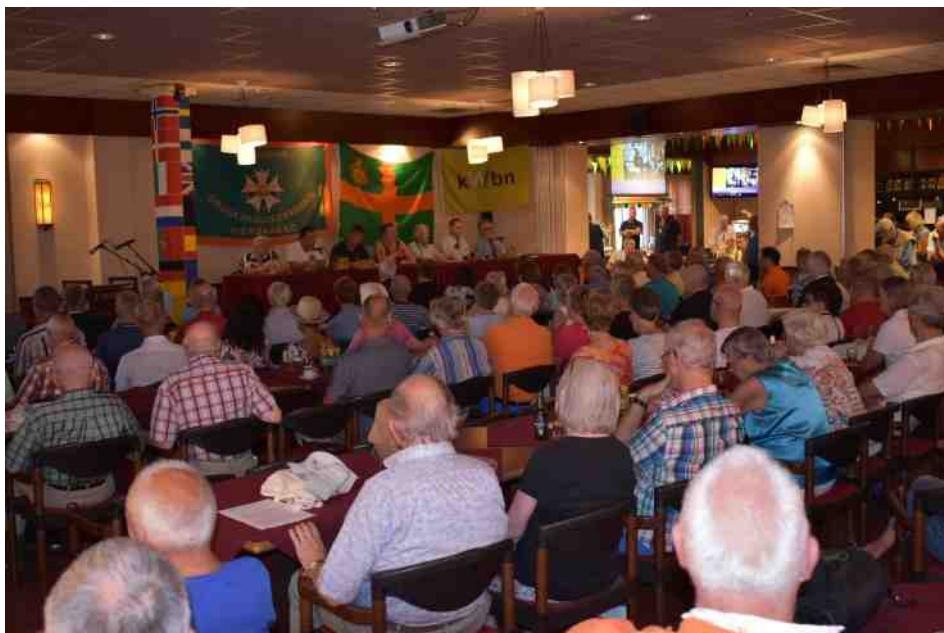
This year the meeting room was full again during the meeting as in previous years.