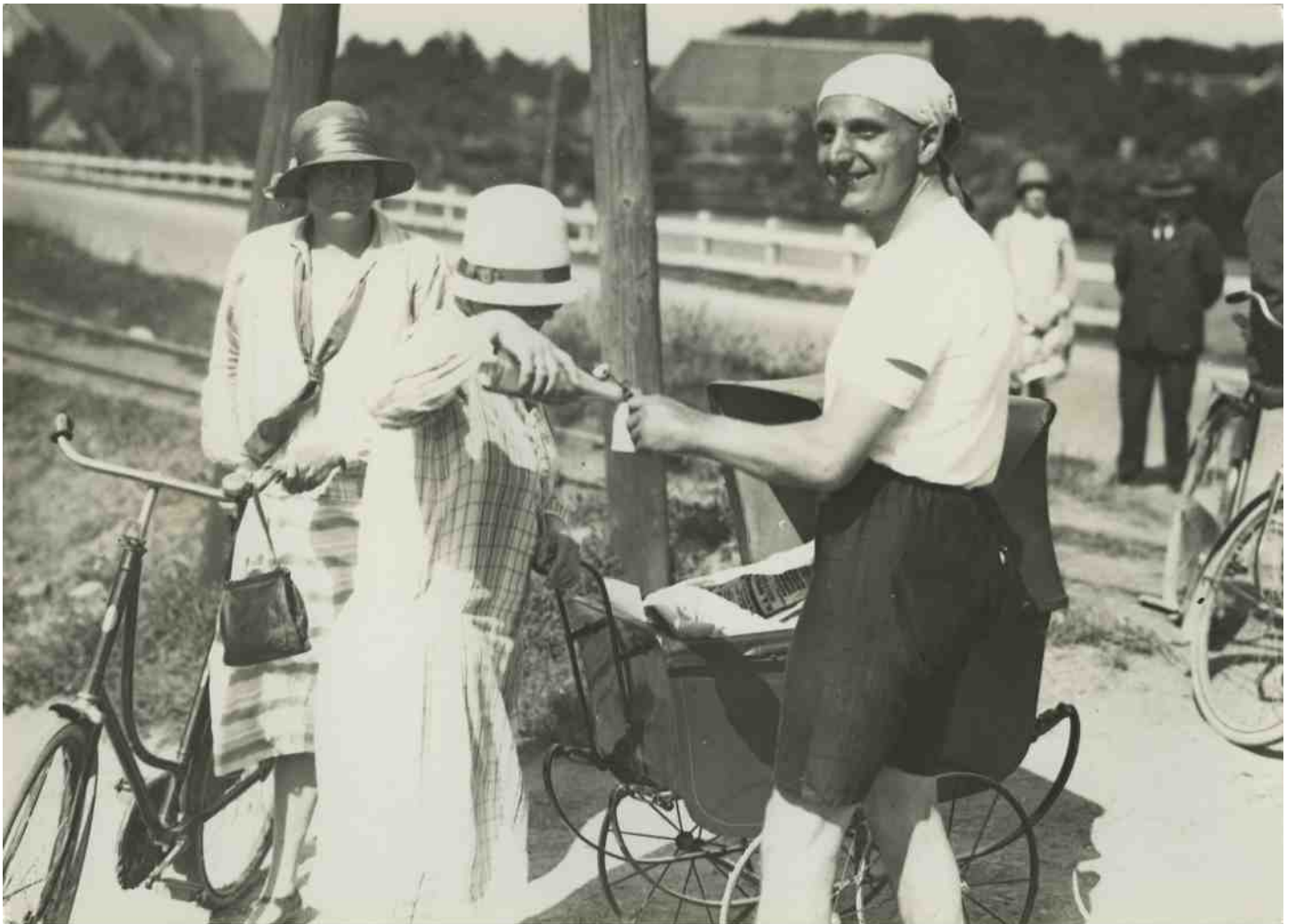
A pram is used for the care of participants in the 19th Four Days Marches in 1929.